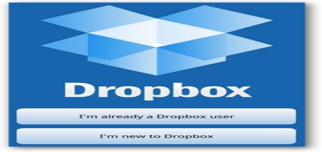
Fig. 2: Diagram on how to start Dropbox

Users can now exchange, store, and host data on the Internet without using mainframes, thanks to cloud services (such as Dropbox, OneDrive, and Google Drive).